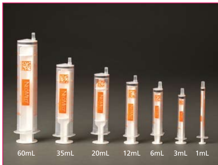
Orange graduation markings and text on the barrel of the syringe are a ®registered trademark of NeoMed, Inc.