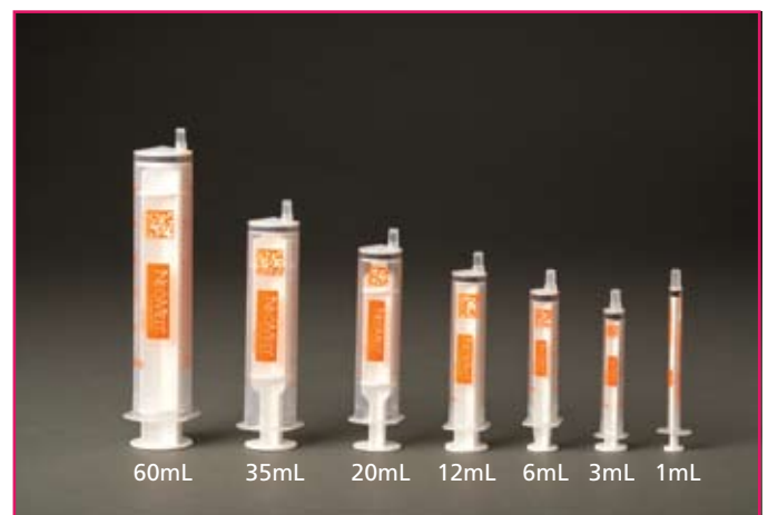
NeoMed also offers a full line of Oral Syringes

Please see back for ordering information